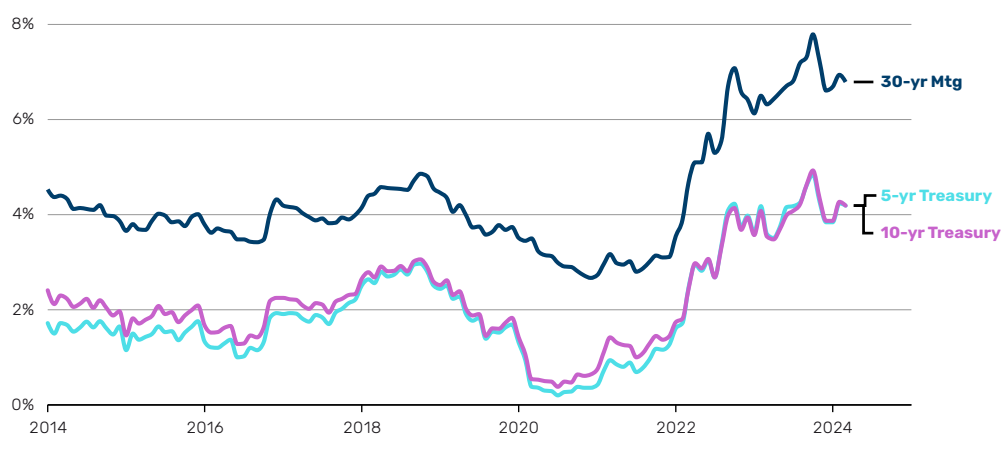
Figure 2. 30-year mortgage rates surged after Fed hikes